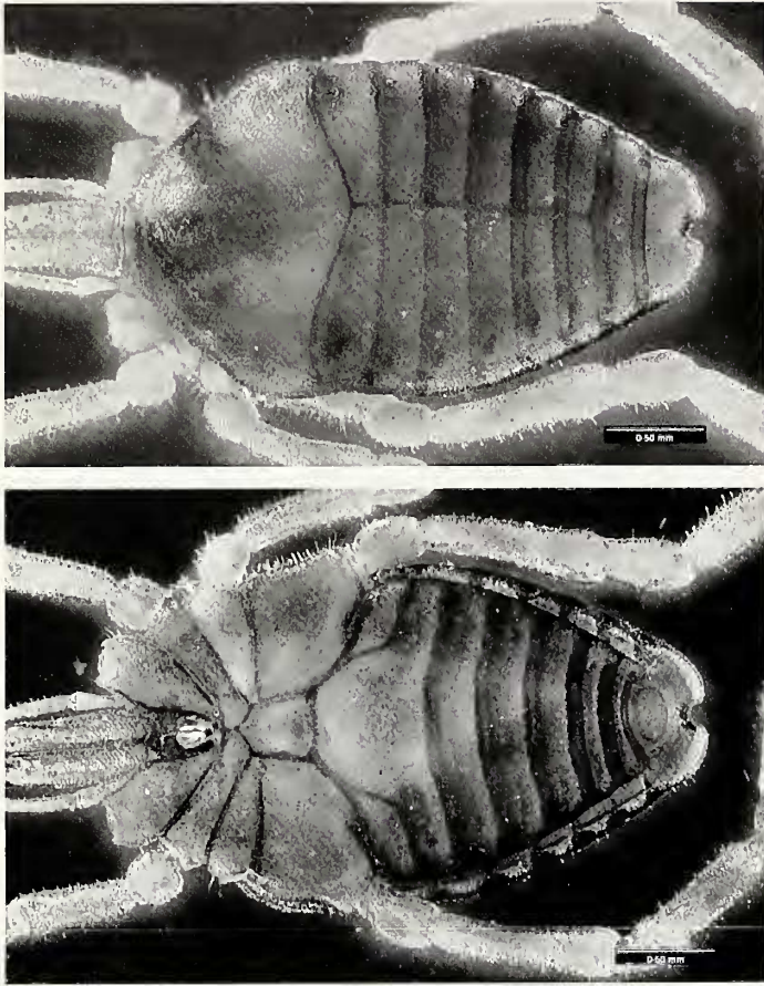
Figure 2.—Holotype of Pettalus brevicauda in dorsal (top), and ventral (bottom) views. Scale bar = 0.5 mm.

typical of immature specimens. Although we visited Pundaluoya in June 2004, we were not able to locate primary forest, and we did not locate specimens of Pettalus in the tea plantations. In 2001 I received a loan from NHM supposedly containing the types of both species. However, both specimens, a large male and a much smaller subadult male, were labelled in pencil and using the same font as " Pettalus brevicauda " from "Punduloaya" collected by E.E. Green.